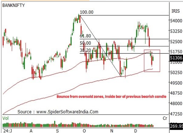
Technical Chart : Daily