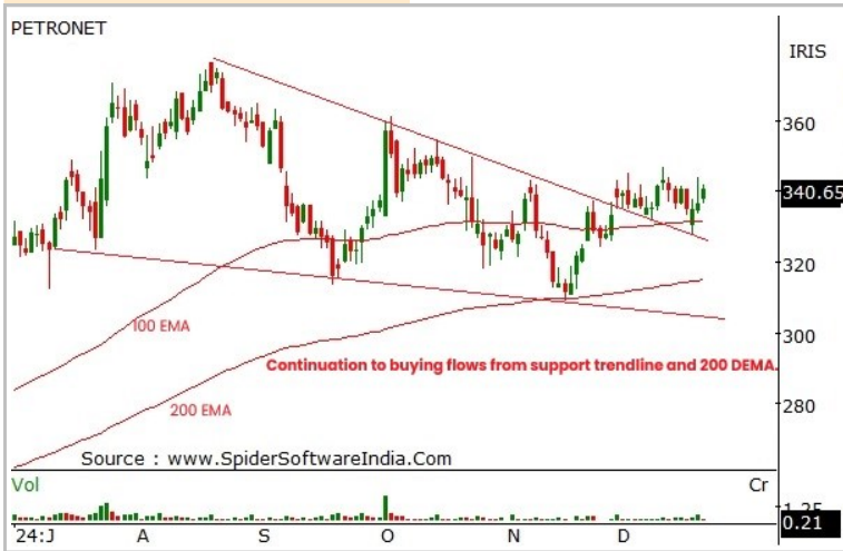
Technical Chart : Daily